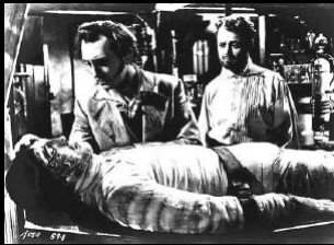
Curse of Frankenstein, 1957 D: Terence Fisher A: Christopher Lee (Monster), Peter Cushing (Baron Frankenstein)