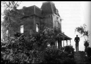
Psycho, 1960 D: Alfred Hitchcock, N: Robert Block A: Janet Leigh, Anthony Perkins