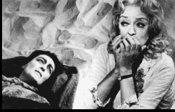
Whatever Happened to Baby Jane, 1962 D: Robert Aldrich A: Betty Davis, Joan Crawford