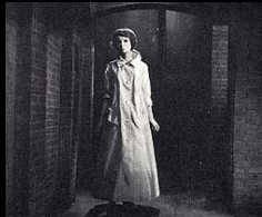
Les Yeux Sans Visage, 1959 D: Georges Franju A: Alida Valli, Edith Scob