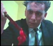
Blood Feast, 1963 D: Hershell Gordon Lewis