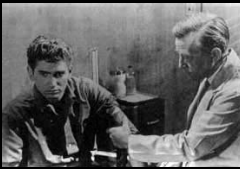
I was a Teenage Werewolf, 1957 A: Michael Landon