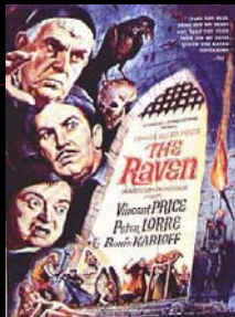
The Raven, 1963 D: Mario Bava A: Vincent Price, Boris Karloff, Peter Lorre, Jack Nicholson