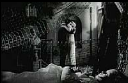
Dementia 13, 1963 D: Francis Ford Coppola P: Roger Corman