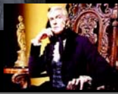
House of Usher, 1960 D: Roger Corman, St: Edgar Allan Poe A: Vincent Price (Roderick Usher)