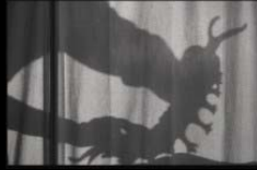
The Tingler, 1959 D: William Castle A: Vincent Price