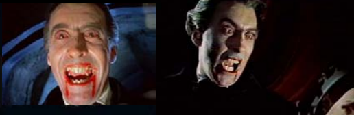
Dracula, 1958 D: Terence Fisher A: Christopher Lee (Dracula), Peter Cushing (Dr. Van Helsing)