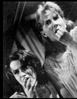
The Haunting, 1963 D: Robert Wise, N: Shirley Jackson A: Julie Harris, Claire Bloom