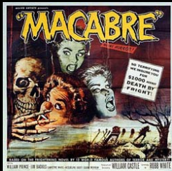
Macabre, 1958 D: William Castle