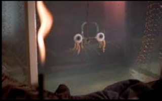
The Revenge of Frankenstein, 1958 D: Peter Cushing (Frankenstein)