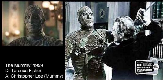
The Mummy, 1959 D: Terence Fisher A: Christopher Lee (Mummy)