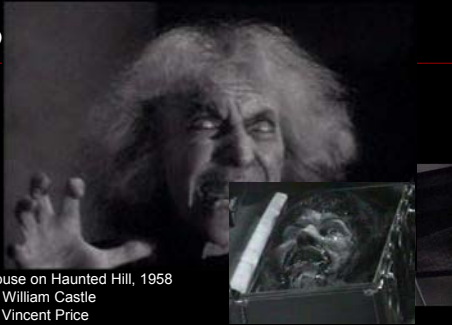
House on Haunted Hill, 1958 D: William Castle A: Vincent Price