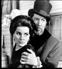
The Haunted Palace, 1963 D: Roger Corman St: Lovecraft A: Vincent Price (Charles Dexter Ward)