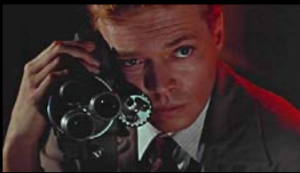
Peeping Tom, 1960 D: Michael Powell A: Karlheinz Boehm