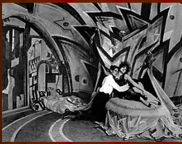
Genuine (Robert Wiene, 1920)