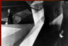
Raskolnikow (Robert Wiene, 1923)